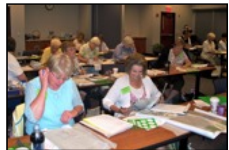
Students designing their gardens, Hilliard, Ohio.

The Washington Consultants Council is composed of Gardening Consultants, Landscape Consultants and Environmental Consultants. These past two years the Council met four times. (9/15/09-visited three home gardens in Chinook District and toured The Cove to see native landscaping for stream restoration and salmon habitat by Doug Osterman; 4/13/10-tour to Pacific Science Center in Seattle to see the Butterfly House, Insect Village and Salt Water Tide Pool exhibits, 9/22/10 toured Sekuma Brothers Berry and Tea farm in Mount Vernon; 3/29/11-Swanson's Nursery presentation Structure and Design in the Garden . by Alex Lavilla and installation). The Council funds a number of WSFGC cash awards (Garden Club Growing Project, Landscape Design, Recycling). --Lana Finegold, Washington Consultants Council President