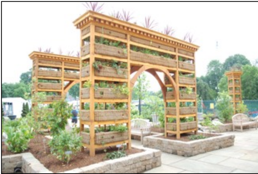
These remarkable planted arches grace the entrance to the U. S. Botanic Garden in Washington D.C. Complete report on page two...

Remarkable private and public gardens were viewed in May