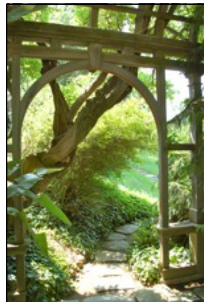
Dumbarton Oaks.