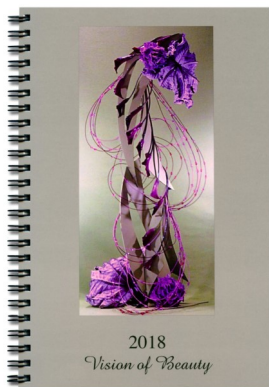
2018 Vision of Beauty Calendar