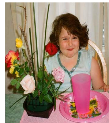
Photo above is of the Palms to Pines District Co-Directors' beautiful granddaughter, preparing her table design for a flower show.