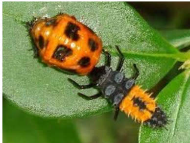
Left is the pupa stage which looks like a dried up lady bug. Don't disturb it for it turns into the adult and the cycle starts all over again.

Another garden helper in the plant-sucking insect department is the hover fly (flower fly or serphid fly); they are tiny, bee-like but harmless, and hover like tiny helicopters above infested plants. Their larvae, which resemble tiny worm-like caterpillars are also the ones with the big appetites. The hover fly is the picture at the right.