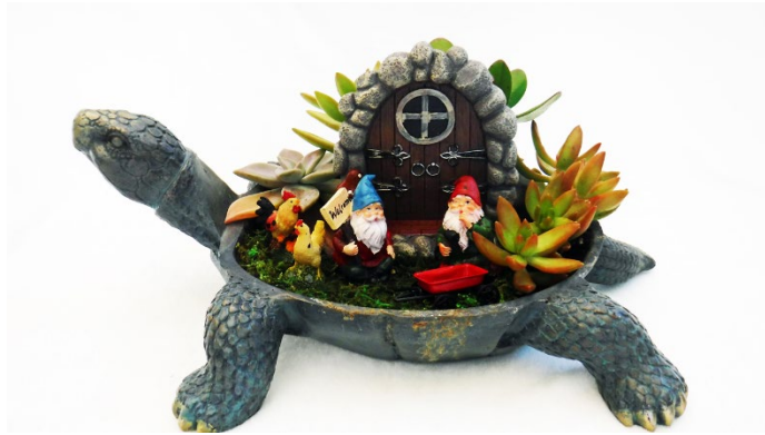
Two gnomes enjoying themselves after gardening and playing with their pet chickens. Crassula ovata (Jade Plant), Sedum adolphii (Golden Sedum) and moss.

Plants — A container garden relies on the use of miniature and dwarf plants. Choose ones that will thrive in a container. Remember, "Right plant, right place." Succulents and houseplants are usually used. Very Important: All plants should have the same growing conditions: the same sun, soil, food and water requirements. Add the focal plantings first — remove enough potting soil from the container to accommodate a tree or two so that, when planted, the tops of the root balls are about an inch from the top of the pot. Gently tease the roots apart, plant, and firm the soil around the roots. Then, plant the moss and other plants.