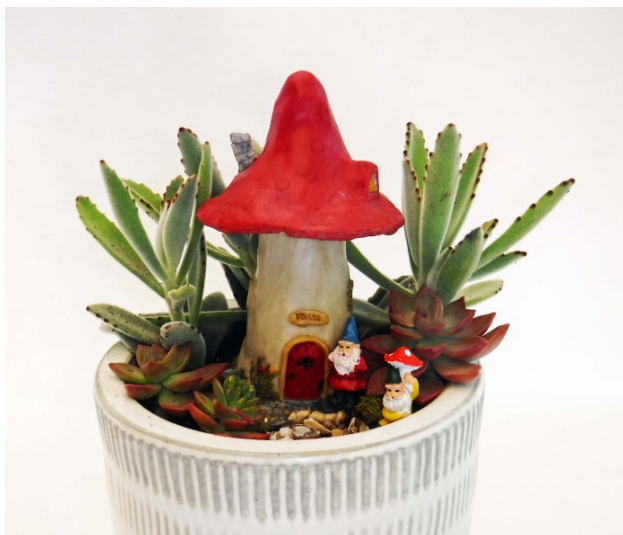
Two gnomes are looking over their garden of succulents. Kalanchoe tomentosa (Panda Plant) and Sedum adolphii (Golden Sedum).

Plants — A container garden relies on the use of miniature and dwarf plants. Choose ones that will thrive in a container. Remember, "Right plant, right place." Succulents and houseplants are usually used. Very Important: All plants should have the same growing conditions: the same sun, soil, food and water requirements. Add the focal plantings first — remove enough potting soil from the container to accommodate a tree or two so that, when planted, the tops of the root balls are about an inch from the top of the pot. Gently tease the roots apart, plant, and firm the soil around the roots. Then, plant the moss and other plants.