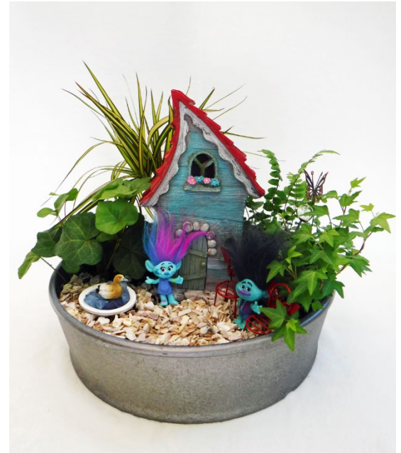
Two trolls watching their pet duck swim in the pool. Two Hedera helix varieties (ivy), Dracaena Marginata (Madagascar Dragon), and Pteris cretica (Brake Fern).