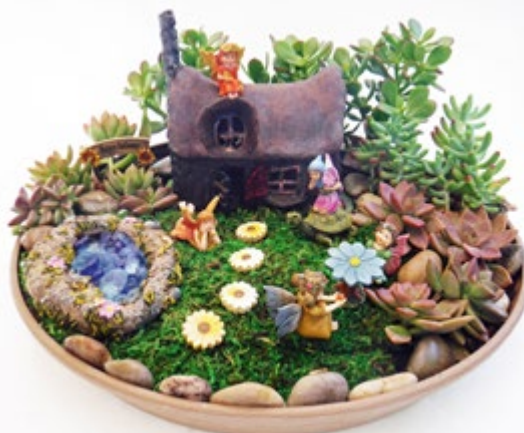
Five fairies playing in their succulent garden. Crassula ovata (Jade Plant), Sedum adolphii (Golden Sedum), Sedum pachyphyllum (Jelly Beans) and

Throughout the history of civilization, cultures have used some sort of magical being to worship or to blame for the unexplainable events in their lives. "Fairies" appeared centuries ago in early European cultures. In 1902, J.M. Barrie, the author of Peter Pan , wrote "When the first baby laughed for the first time, his laugh broke into a million pieces, and they all went skipping about. That was the beginning of fairies." Often dismissed by "serious" gardeners as too whimsical, perhaps a fairy