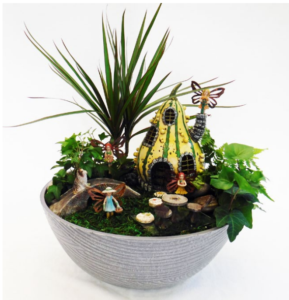
Three fairies playing in their garden in front of their gourd home. Dracaena Marginata (Madagascar Dragon), two varieties of Hedera helix (ivy), Dryopteris erythrosora (Japanese Shield Fern) and moss.

To create a fairy garden, you will need a theme; a container with drainage; and plants which adapt to miniaturization. Important: The key to a successful container fairy garden is SCALE (the relationship of one object to another).